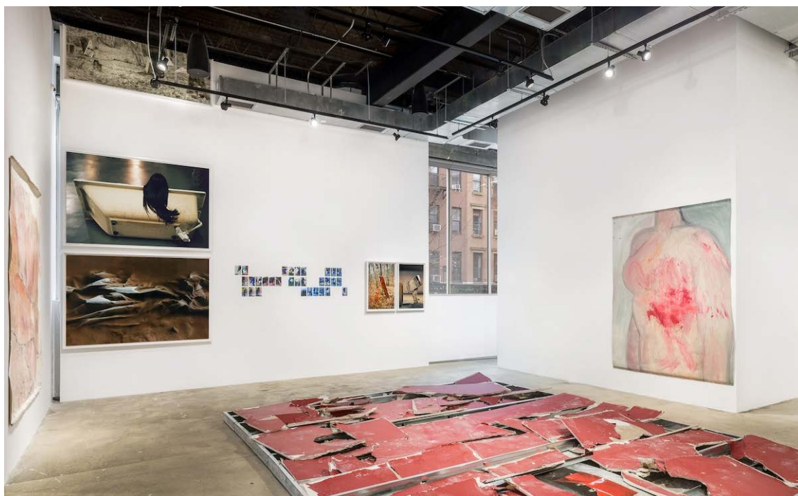
Installation view of "Ser Serpas: Hall," 2023, at Swiss Institute, New York.

BY ALEX GREENBERGER February 15, 2023 11:05am