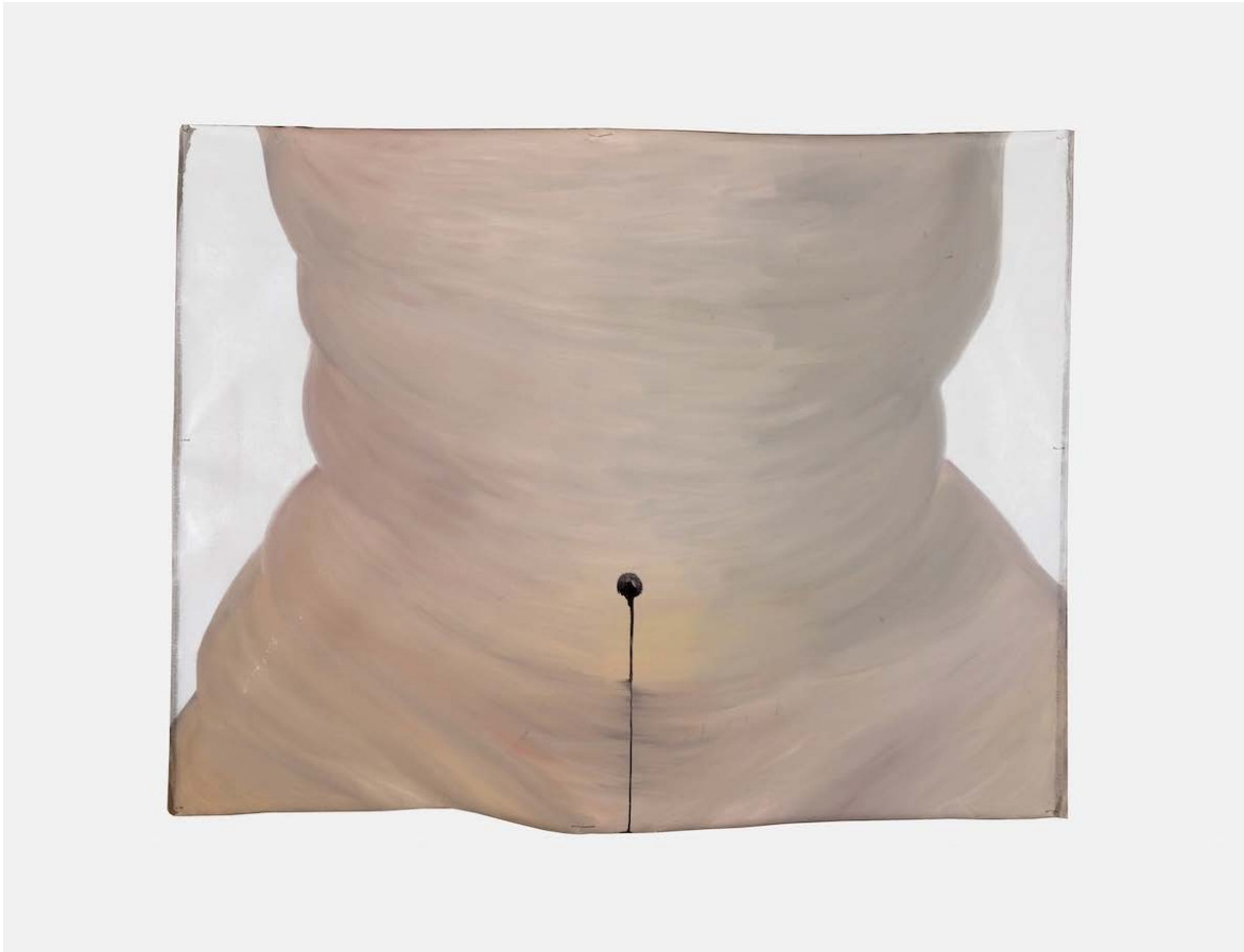
Ser Serpas, Untitled , 2022.

Serpas's paintings move this opacity in a more interesting direction. Done on sizable swaths of unevenly cut jute, they ooze an ominous intensity. One features a chest that has been slathered with what appears to be blood, while another shows a belly button that leaks something like black oil.