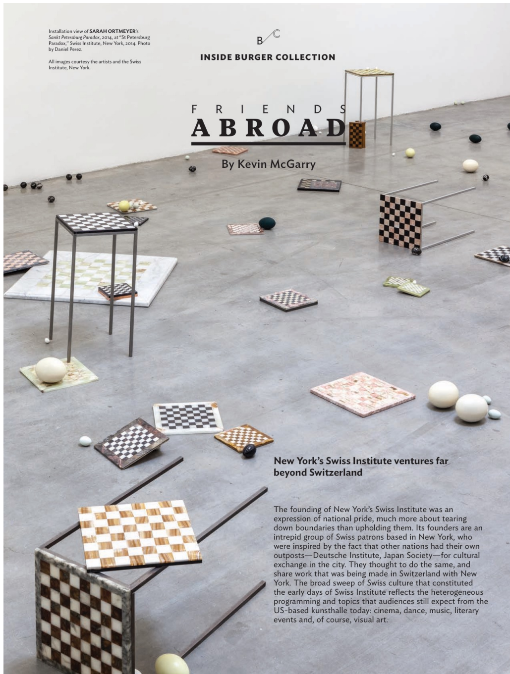
Installation view of SARAH ORTMEYER's Sankt Petersburg Paradox , 2014, at "St Petersburg Paradox," Swiss Institute, New York, 2014.