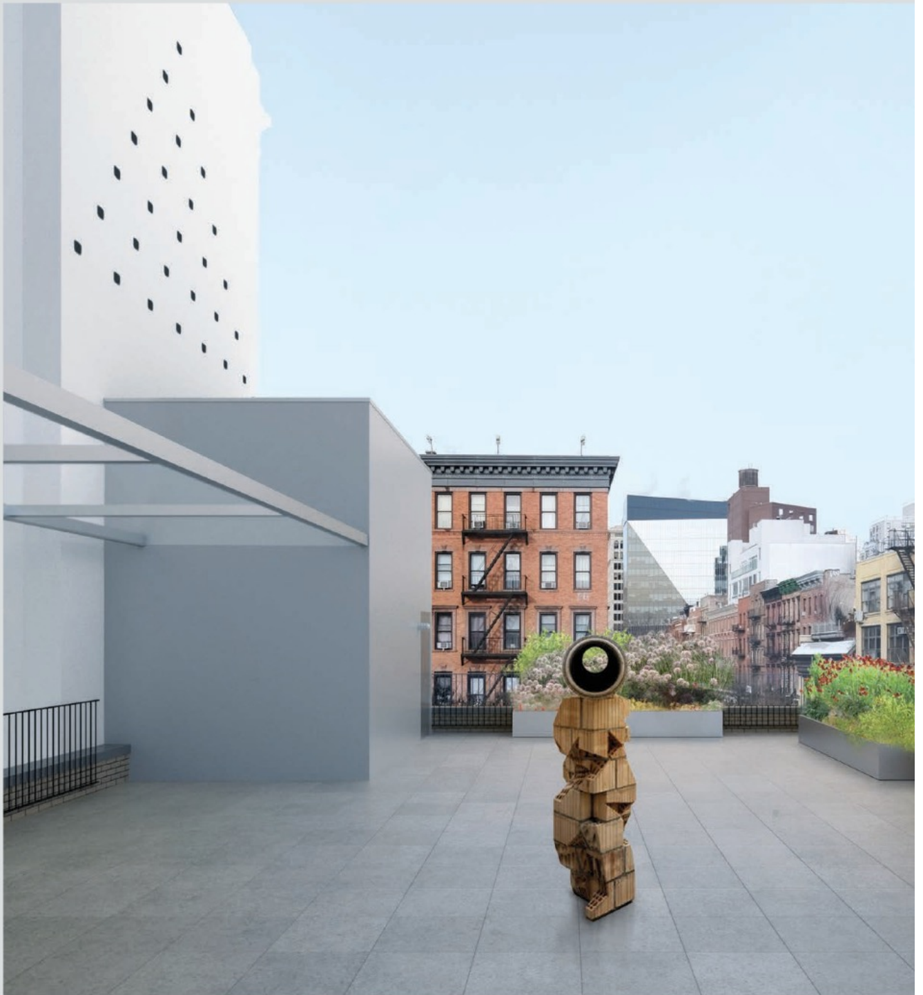
(This page) An architect's impression of the rooftop of the Swiss Institute's new home on 38 St. Marks Place, New York.