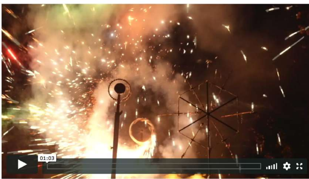
Lorenzo Bernet, documentation of Krating Daeng กระทิงแดง, 2017, Mechanized ground fireworks at the New Glarus Village Park Full gallery of images, press release and link available after the jump.